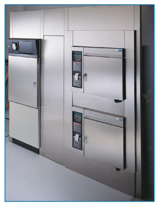
Two compact units can be installed in the same space as a conventional 8.8 cubic foot EO sterilizer.