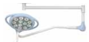
Harmony LED385 Exam light

For more information, please call your STERIS Account Manager or visit www.steris.com .