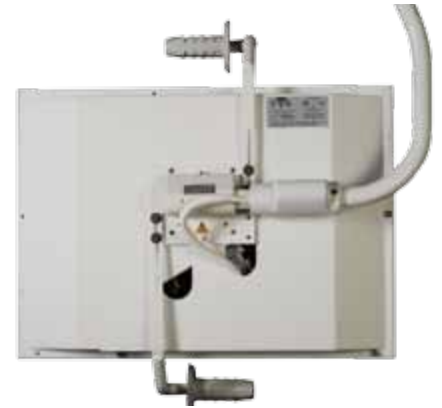
Clean monitor design hides wires and cables.

Harmony ConnectPoint attaches to the bottom of any Harmony LED lighting system to provide DVI, HD-SDI, RGBHV, S-video and composite signals right to the surgical site. The six-foot ConnectPoint arm rotates a full 320°.