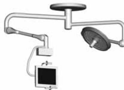
LED585 with Single Flat Panel Monitor