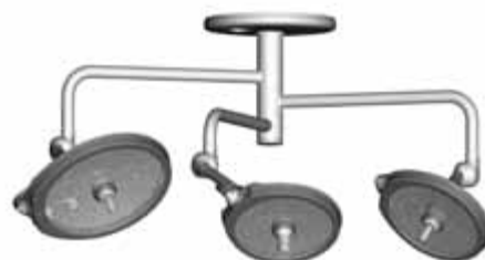
LED785/585/585 Triple Lighthead System