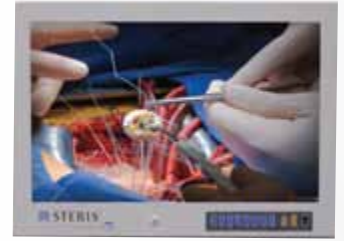
Add a monitor.

Add a light, a monitor, a camera, an ambient light, even a Harmony ConnectPoint video connectivity system – Harmony LED is upgradable to meet your needs. Harmony LED is designed to adapt and grow, so as technology evolves, your investment remains protected!