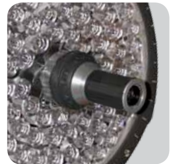
Add an HD camera.