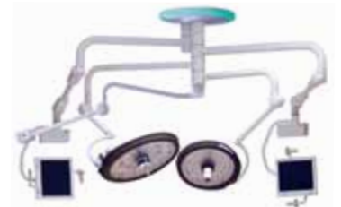
Harmony LED System

Harmony LED is the flagship of our LED lighting family.