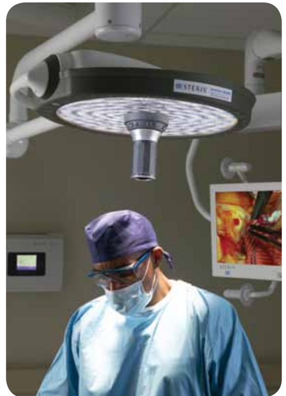
Harmony LED generates 34% less heat than traditional surgical lighting.