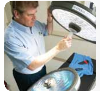
Add a lighthead.