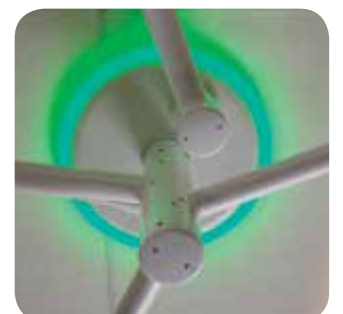
Add an ambient light.