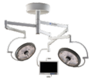
Harmony vLED System

Part of the flexibility of the Harmony LED system is that every lighthead is camera-ready. Regardless of whether you choose the standard definition (SD) or the high definition (HD) camera, you can easily unscrew the regular handle and insert the camera. Our high-performing system automatically recognizes the camera and allows you to control it from the wall-mounted control panel or from your Harmony iQ integration system touchpanel.