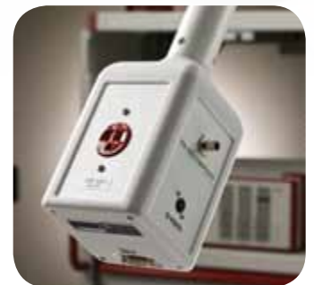
Add a ConnectPoint