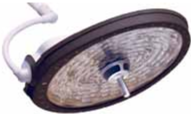
120 LEDs in Harmony LED785