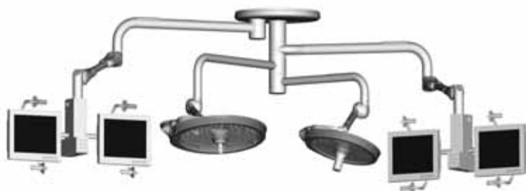
LED785/585 with two Dual Flat Panel Monitors