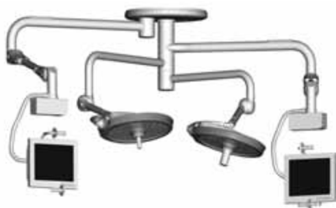
LED585/585 with two Single Flat Panel Monitors