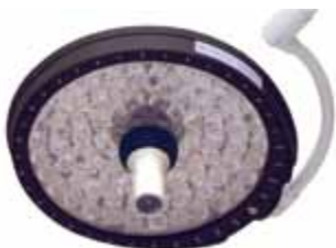
84 LEDs in Harmony LED585